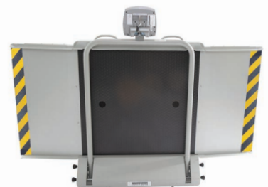
Platform Folds for Mobility and Storage

To learn more, call 1-800-815-6615 or visit homscales.com/2620KL