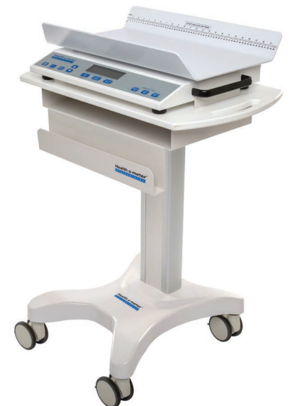
2210CART-AC Multi-Function Acute Care Cart for 2210KL-AM-C Series of Scales

Scale also includes connectivity capabilities. To learn about connectivity options, visit homscapes.com/ConnectivitySolutions